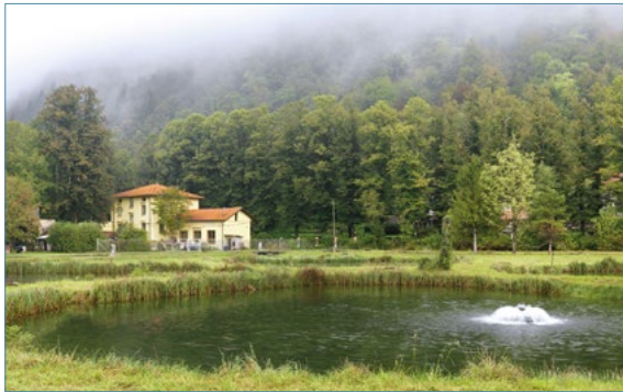
FRIS fish farm in Kobarid (Slovenia)

The Ticino Park helps FRIS by giving fish during the first years of the project and by providing his experiences. The FRIS takes care of the repopulation of the water courses of Vipava Valley.