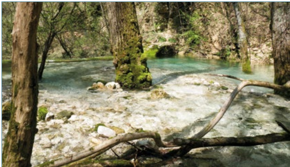
Vipava River (Slovenia).

Ticino Park is able to reproduce Lasca in captivity condition thanks to procedures developed under the Life project CON.FLU.PO. For this reason it helps FRIS in the organisation of a fish farm suitable for Lasca, giving young fish born in Parco's hatchery and providing breeders .